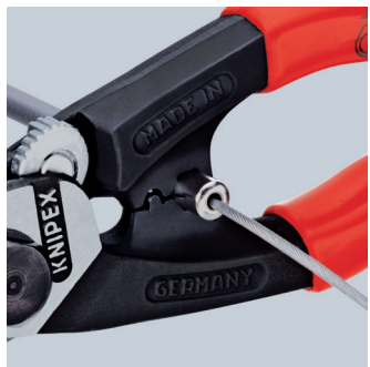
Crimping of the end caps on the Bowden cable sheath