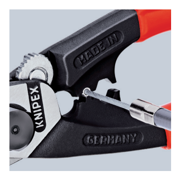
Crimping of the ferrules onto the traction cable