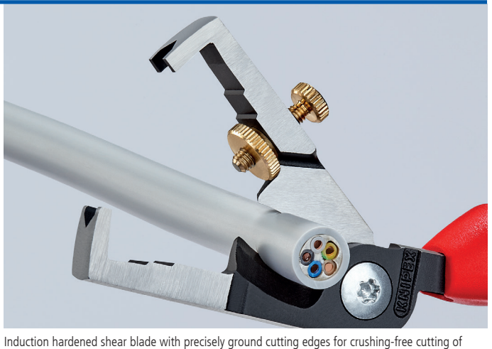
Induction hardened shear blade with precisely ground cutting edges for crushing-free cutting of copper cables up to 9/16" (15 mm \emptyset ) (5 x 2.5 mm<sup>2</sup>)