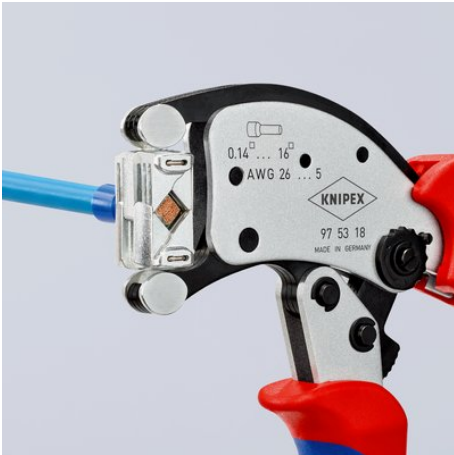
Uniquely flexible: connectors can be inserted in the rotatable crimp head from almost any position