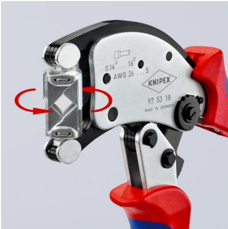
Crimp head can be rotated 360° for optimal accessibility, even in confined spaces