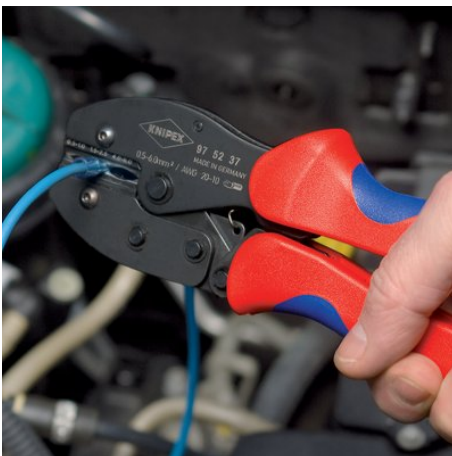
97 52 37