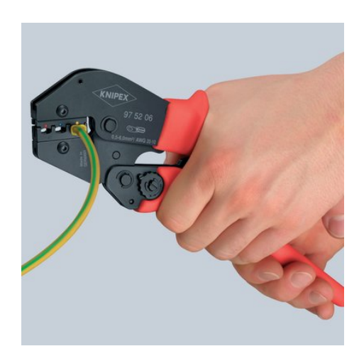
Third step: when greater hand force is required, such as e.g. when crimping insulated connectors 6.0 mm², twohand operation is possible by the longer handles