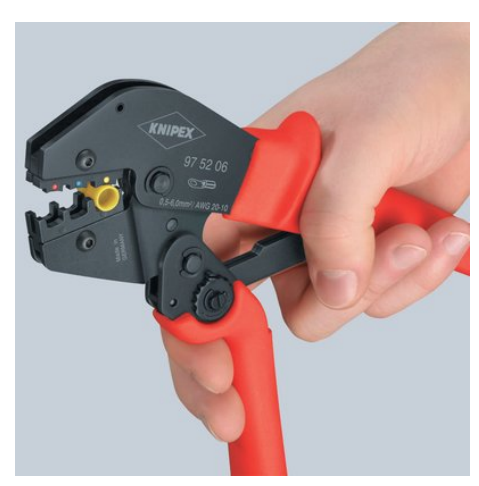
First step: move the handle with two fingers only until both jaws touch the connector to be crimped