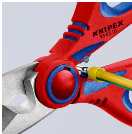
95 05 10 SB: Fast, easy crimping