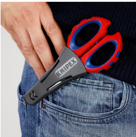
Securely stowed and always at hand