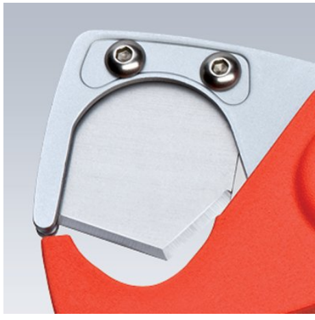
With replaceable blade