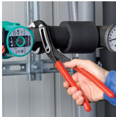
Self-locking on pipes and nuts: no slipping on the workpiece; the complete actuating force can be used to turn the workpieces; not having to squeeze the pliers handles reduces the required effort