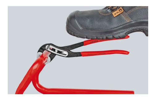
Self-locking on pipes and nuts: no slipping on the workpiece; the complete actuating force can be used to turn the workpieces; not having to squeeze the pliers handles reduces the required effort