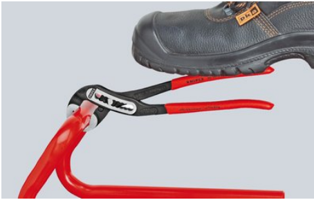
Self-locking on pipes and nuts: no slipping on the workpiece; the complete actuating force can be used to turn the workpieces; not having to squeeze the pliers handles reduces the required effort