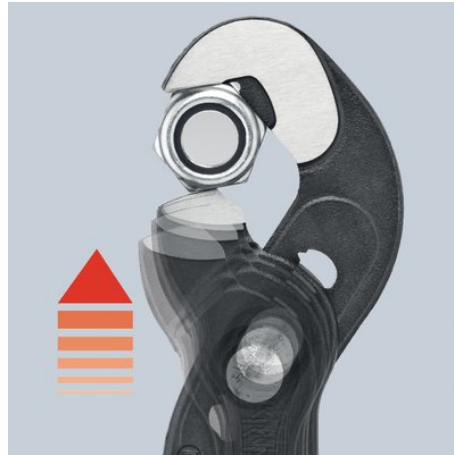
Fine adjustment by pushing a button: fast and comfortable.