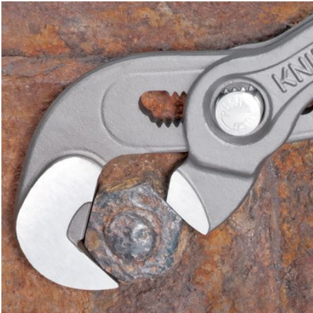
In operation on rusted nut with rounded edges