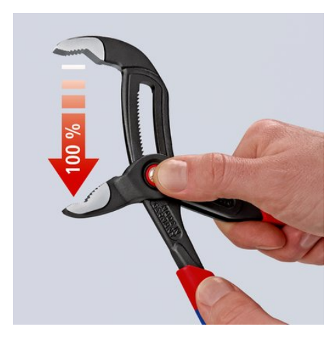
Press the button – open pliers completely

Position jaw – simply slide and close pliers