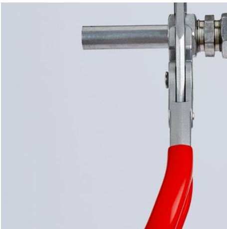
Angled handles for more room to grip