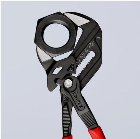
Opening width lasered onto the pliers head (metric on the front and imperial on the back)