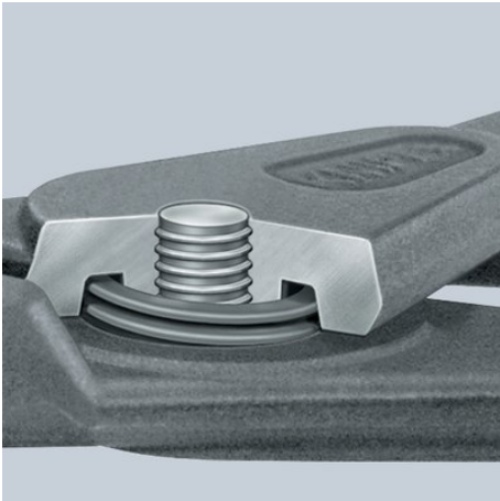
Spring inside the joint: the spring is protected inside the precisely bolted joint. It does not hinder work and cannot get dirty or lost.