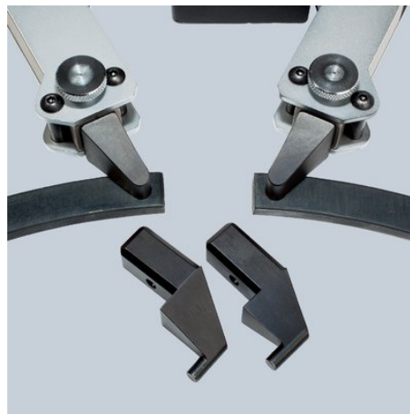
replaceable inserts for internal and external circlips