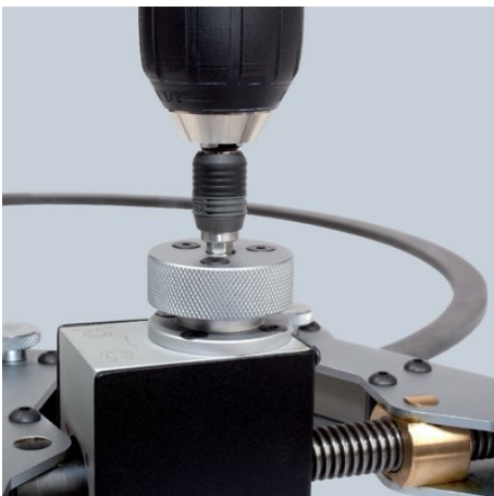
Power tool or manual operation