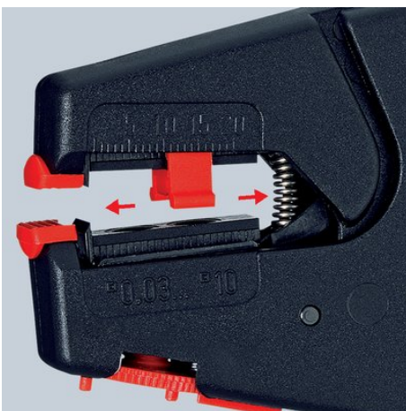
12 40 200: Adjustable length stop