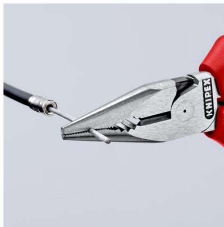
Milled groove in the gripping area