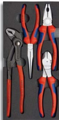
00 20 01 V01