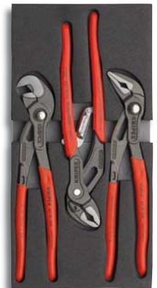
00 20 01 V03