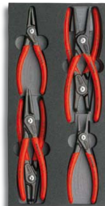
00 20 01 V02