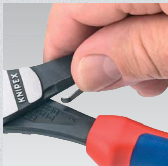
The spring can be activated by simply pressing with the thumb