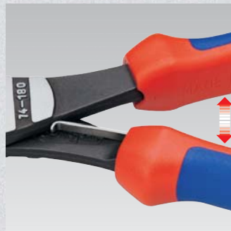
View of the rear side with activated opening spring