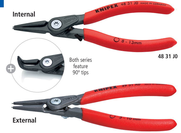
49 31 A0