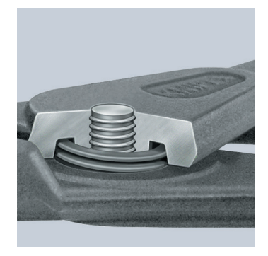
External precision circlips have a spring inside the joint – prevents spring from getting dirty or lost