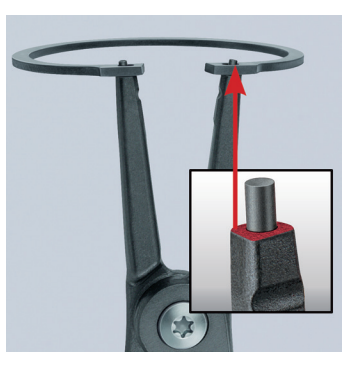
Precision circlip tips fit circlips without distortion