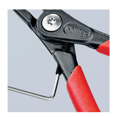
Overstretching limiter with screw stop prevents overexpansion of circlips